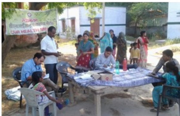
Product distributing in Ahmadpur (UP)

These products meets 40% of iron and calcium requirement according to recommended daily allowances (RDA)