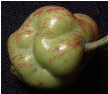
Deformed and diseased apples

Suitable for testing Apple chlorotic leaf spot virus , Apple stem grooving virus , Apple stem pitting virus , Apple mosaic virus and Apple scar skin viroid