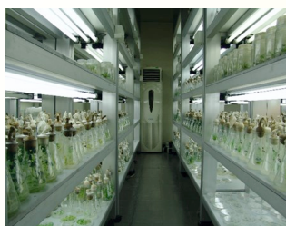
Plant Tissue Culture Facility